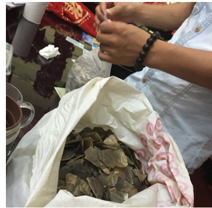
Raw pangolin scales for sale in TCM wholesale market

When asked about the source of the scales, most traders refused to answer or answered evasively, clearly illustrating their knowledge of the laws and the illegality of the trade. Only 34% of animal medicine wholesalers with scales for sale were willing to reveal their source—pangolin scales sourced from overseas were mainly claimed to be from Southeast Asian countries, including Myanmar and Viet Nam, as well as African countries. Scales from domestic sources were mainly from Guangxi and Yunnan provinces (which border Viet Nam and Myanmar respectively). However, according to traders in Guangxi, Viet Nam was merely a transit country for pangolin scales, and a lot of scales were in fact sourced from Pakistan. 18% of TCM retail shops with scales for sale revealed that scales were bought from pharmaceutical companies, except for one shop that sourced them from Viet Nam. Since pangolin scales are only allowed to be sold in designated TCM hospitals and to be manufactured into patented medicine by authorized pharmaceutical companies, TCM retail shops should not legally be able to source pangolin scales from pharmaceutical companies.