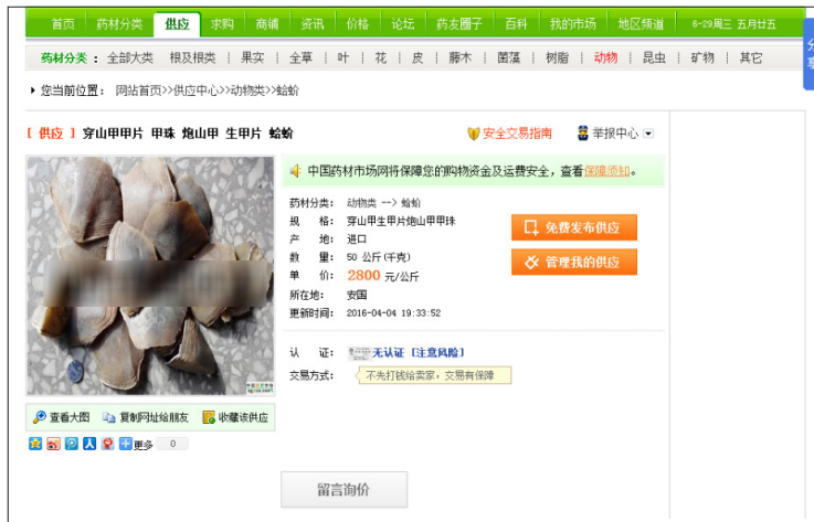
Raw pangolin scales for sale on a TCM website

scales shown under the categories “Medicine”, “Animal” and “others”. Advertisements for pangolin scales included phrases such as “African pangolin scales on offer”, “Myanmar wild pangolins on offer”, “rare and valuable medicine ingredients Pangolin scales on offer”, etc. Besides pangolin scales, researchers also came across one advertisement for pangolin meat (USD180/kg) and two advertisements for pangolin for captive breeding purposes.