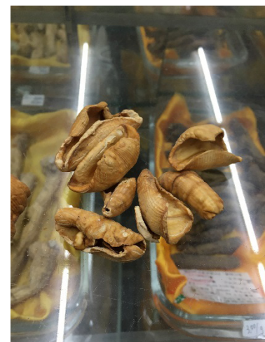
Processed pangolin scales for sale in retail TCM shop

The survey found that the major types of pangolin products on sale were raw scales, processed scales, scale powder and scale/nail carvings. In total, 74 animal medicine wholesalers and 67 TCM retail shops were found to offer pangolin scales for sale, and 13 shops for collectibles were found to sell pangolin scale/nail carvings. Compared with a survey conducted by TRAFFIC ten years ago (Xu, 2009), the percentage of TCM retail shops selling pangolin scales decreased from 82% in 2006/2007 to 62% in 2016. Meanwhile, the percentage of stalls in TCM wholesale markets selling scales increased from 12.5% in 2006/2007 to 35% in 2016, indicating that the illegal trade of pangolin scales is still on-going in China’s TCM markets. However, a positive change has been seen in terms of the consumption of pangolin meat. Only two (2%) restaurants surveyed clearly stated that pangolin meat was offered while 9 (18%) restaurants had pangolin meat for sale in 2006/2007, and “pangolin” or “ground dragon” was never even identified in restaurants outside of Guangdong, Guangxi and Yunnan